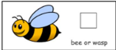
bee or wasp