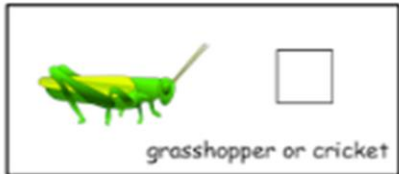
grasshopper or cricket