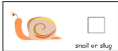
snail or slug

Can you find these bugs around your garden or home?