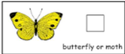
butterfly or moth